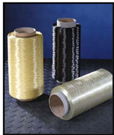
Prepreg Tow (Towpreg)

TCR Composites offers unique thermosetting epoxy matrix resin systems featuring a range from one-year to one-month shelf life without refrigeration. These resins are currently used to manufacture prepreg in the following forms: tow/roving, unidirectional tape, woven fabric, and braid.